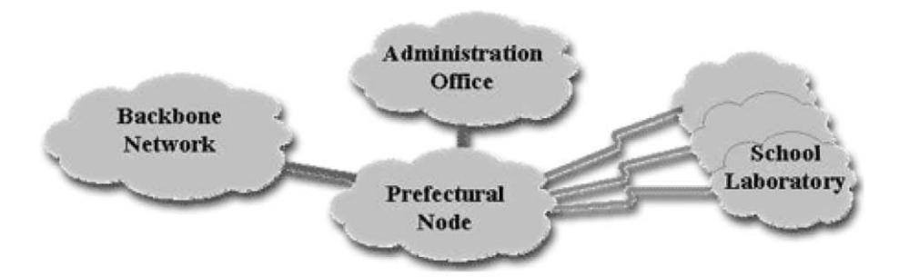
Fig. 2. The Greek School Network topology.

backbone network through connections with the nearest prefectural node Winds of Aiolos, 2000.