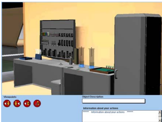
Figure 1. Virtual Radiopharmacy Laboratory: The study mode

In the study mode, as it is shown in Fig. 1, the user can interact with the environment without the presence of other users. His/her help is an intelligent learner modeling that provides assistance to the user according to the dynamic actions that s/he performs on the available equipment of the virtual space.