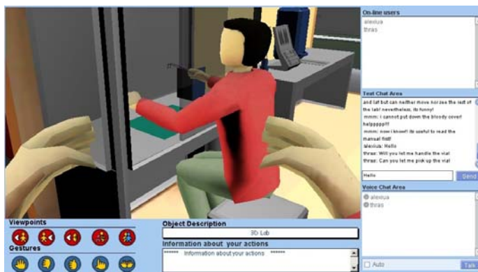
Figure 2. Virtual Radiopharmacy Laboratory: The multi-user mode.

The multi-user mode of the Virtual Radiopharmacy Laboratory, as it is shown in Fig. 2, provides a virtual environment that allows learners to interact with other learners / mentors or with the equipment of the laboratory, exactly as it would happen in a real radiopharmacy laboratory.